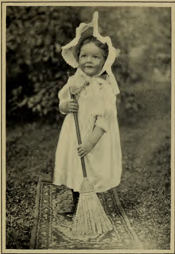
A LITTLE HELPER